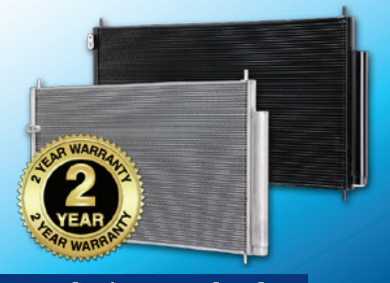
Exclusive to Adrad