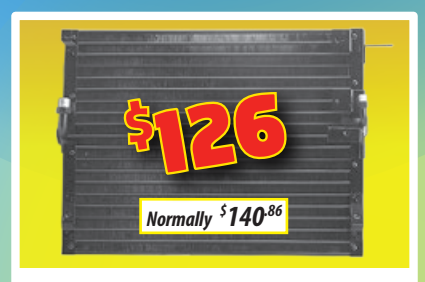
TOYOTA LANDCRUISER 79 SERIES DIFSFI 99- ADAIR ⇒⇒