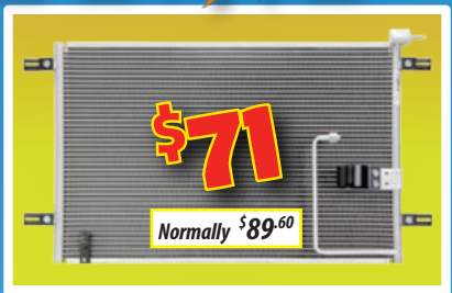
HOLDEN COMMODORE VZ 8/04-7/06 + MANY MORE HOLDEN MODELS ADAIR ⇒⇒ CHOL32