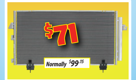
TOYOTA RAV4 20 SERIES 2.4L 9/03-2/06 ADAIR ⇒⇒ CTOY81

Prices exclude GST & Freight. Expires Dec 31 or while stocks last