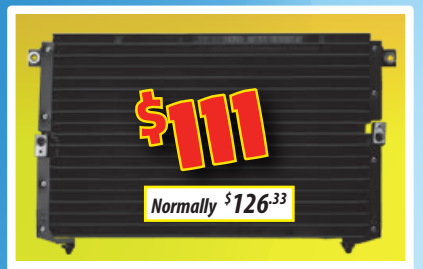
HOLDEN RODEO TF R7 (2/97-2/03) Diesel & Petrol CHOL39