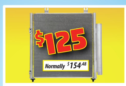
MITSUBISHI MIRAGE LA Hatch (13-3/15) LA Sedan (14-) CMIT42K KOYOAIR